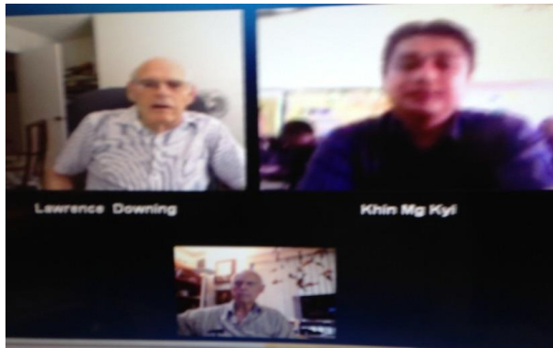
Skype system screen, 4 August 2014